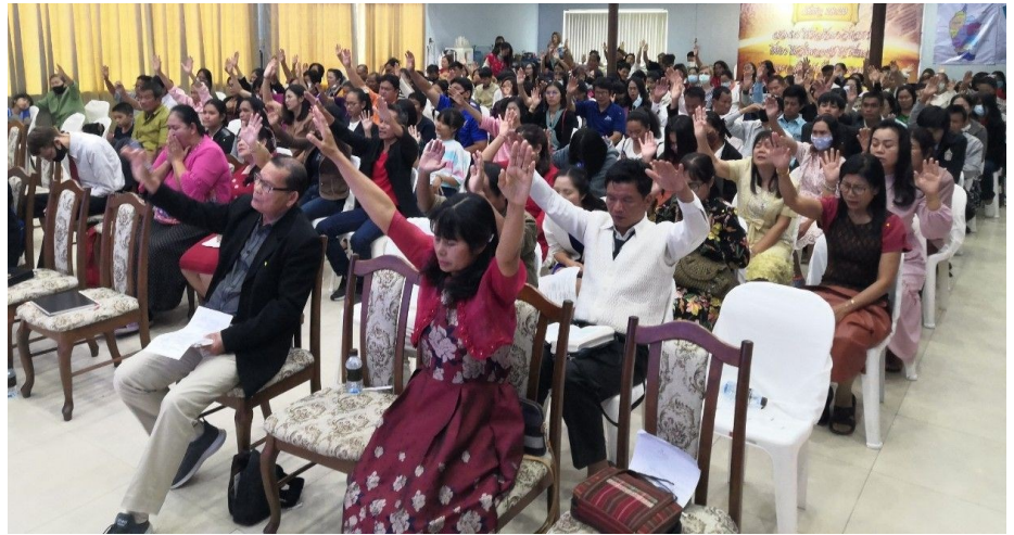
Thai Christians gathered to intercede for Thailand during "Tears for the Lost" project.

Ethnos Asia Ministries works hand-in-hand with Thai churches to help achieve this vision goal. A few years back, Vision 20 was conceived; to plant a Christ-centered, mission-minded and healthy church in twenty