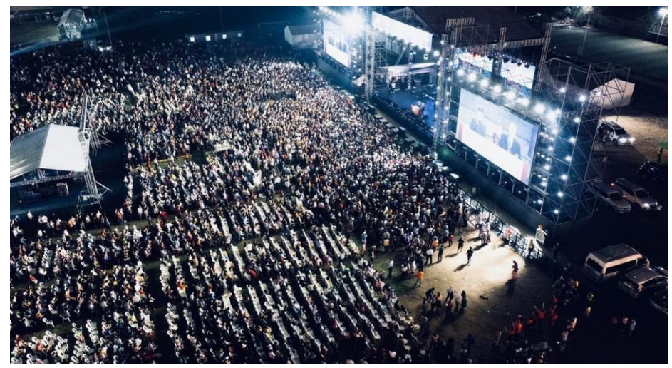
Over 4,500 souls crowded the stage to receive Christ during the Franklin Graham crusade.

During this preparation period, the Vietnam Evangelical Alliance (VEA) was launched, forging the unity of North and South Vietnam churches, both official and underground house churches. Foremost leaders came together, asking God what to do since evangelical Christians comprised only 2% of the population. They needed to proclaim the Gospel of the Kingdom and they decided to invite Franklin Graham to come. It was not possible in 2019, so they postponed to 2020 but then the pandemic came. However, it became an opportunity for Christians to reach out with food, medicines, clothes, and basic necessities, regardless of religious affiliation. The